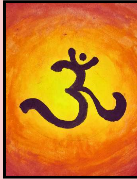
-Bhavya Y. Varde (VII)