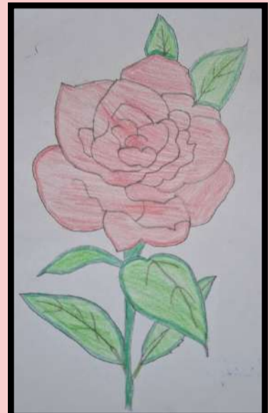
-Birwa I. Chhasatiya (VI)